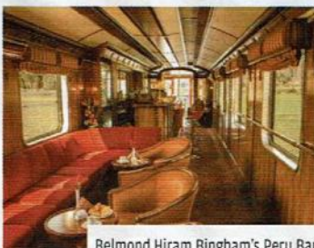
Belmont Hiram Bingham's Peru Bar

station and the journey time to Machu Picchu is one hour and 50 minutes.